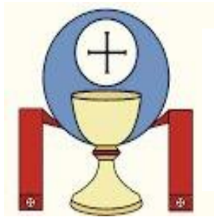
50 TH Anniversary of Ordination